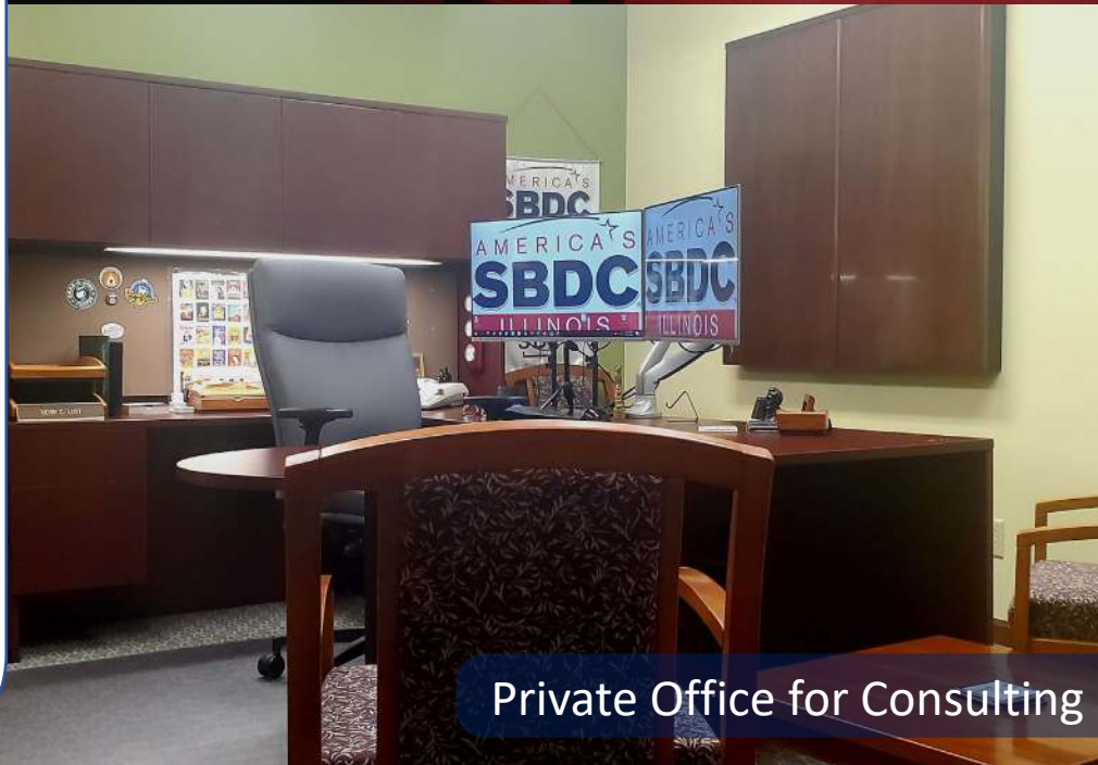
Private Office for Consulting

The Illinois SBDC for Central Illinois brings a special market focus to the service sector. The seat of State government, the Springfield area economy is heavily weighted to service-oriented businesses and there are a great number of opportunities for businesses of all sizes in that marketplace. Also, the Director has built extensive experience and an additional market sector focus in the restaurant industry.